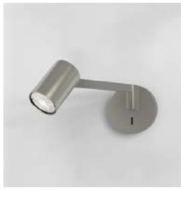
CODE: 1286069 FINISH: MATT NICKEL