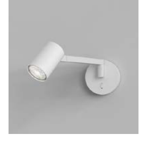
CODE: 1286068 FINISH: TEXTURED WHITE